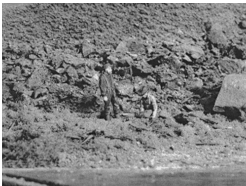
Two 1880s geologists in the field