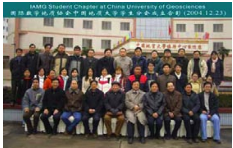
Back two rows are student members.

IAMG-SCC consists currently of graduate and undergraduate students who are interested in mathematical geology, GIS/RS/GPS, and statistics etc. Total number of members enrolled is 37. The most student members are the graduate students of the State Key Laboratory of Geo-Processes and Mineral Resources, Faculty of Mineral Resources of China University of Geosciences (Wuhan). IAMG-SCC has planned a number of regular seminar activities held on CUG campus, local mathematical geology workshops for students from China, and report to be presented as IAMG2005 annual conference.