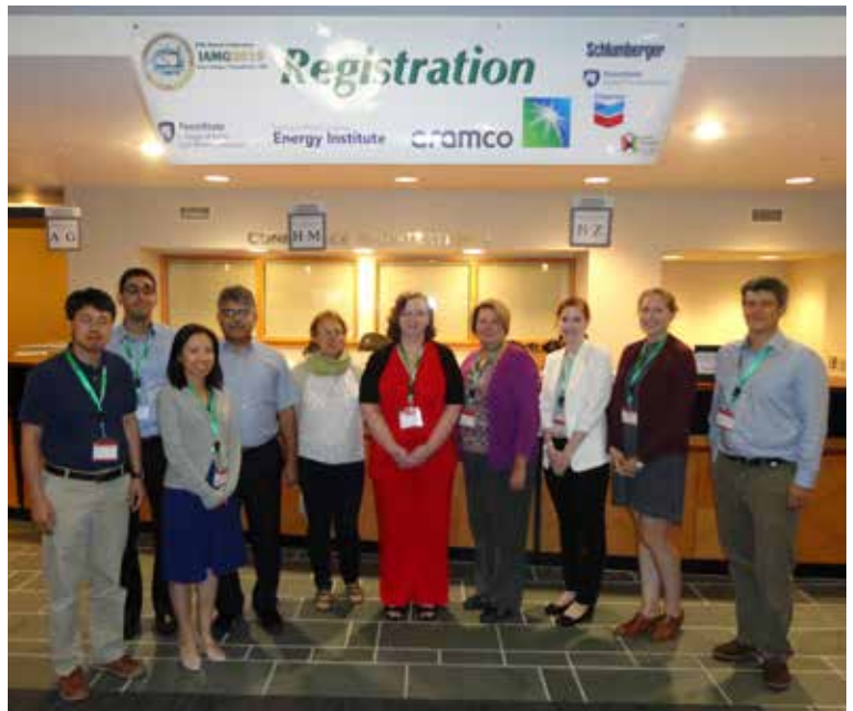
IAMG2019 organising committee