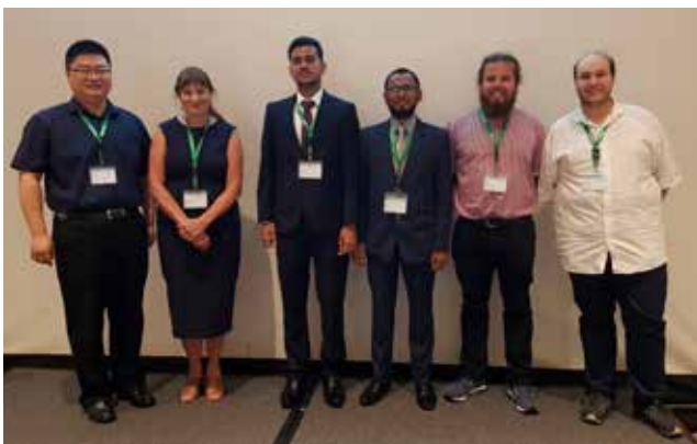
Student awards presentation